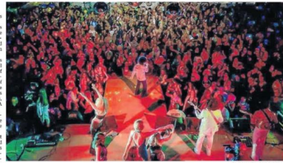
The Centurions will host a fundraising event, "Peace, Love, Centurions," on April 27 at Kino Sports Complex.